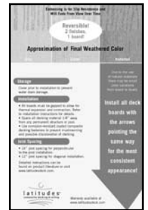
(B) product sticker

Additional blocking may be needed for support (see Figure 1). Allow 1/4" distance between all decking material and any permanent structure or post. After all of the decking has been attached, snap a chalk line (white or yellow chalk recommended) flush with or up to 1-1/2" out from the deck framing and trim with a circular saw. Latitudes Decking, like all wood and composite decking products, requires proper ventilation and drainage in order to ensure its longevity. When using a minimum 2x6 joist standing on edge and the suggested 1/4" side gap, there should be a 2" clear space between the bottom edge of the joists and grade in order to allow for proper ventilation. Adequate drainage is also needed to prevent water from pooling under the deck.